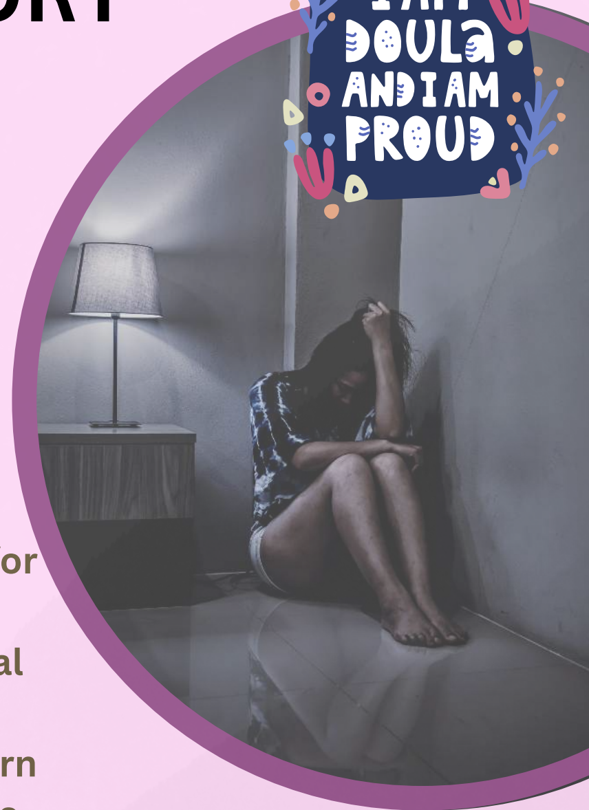
mould taking over her home